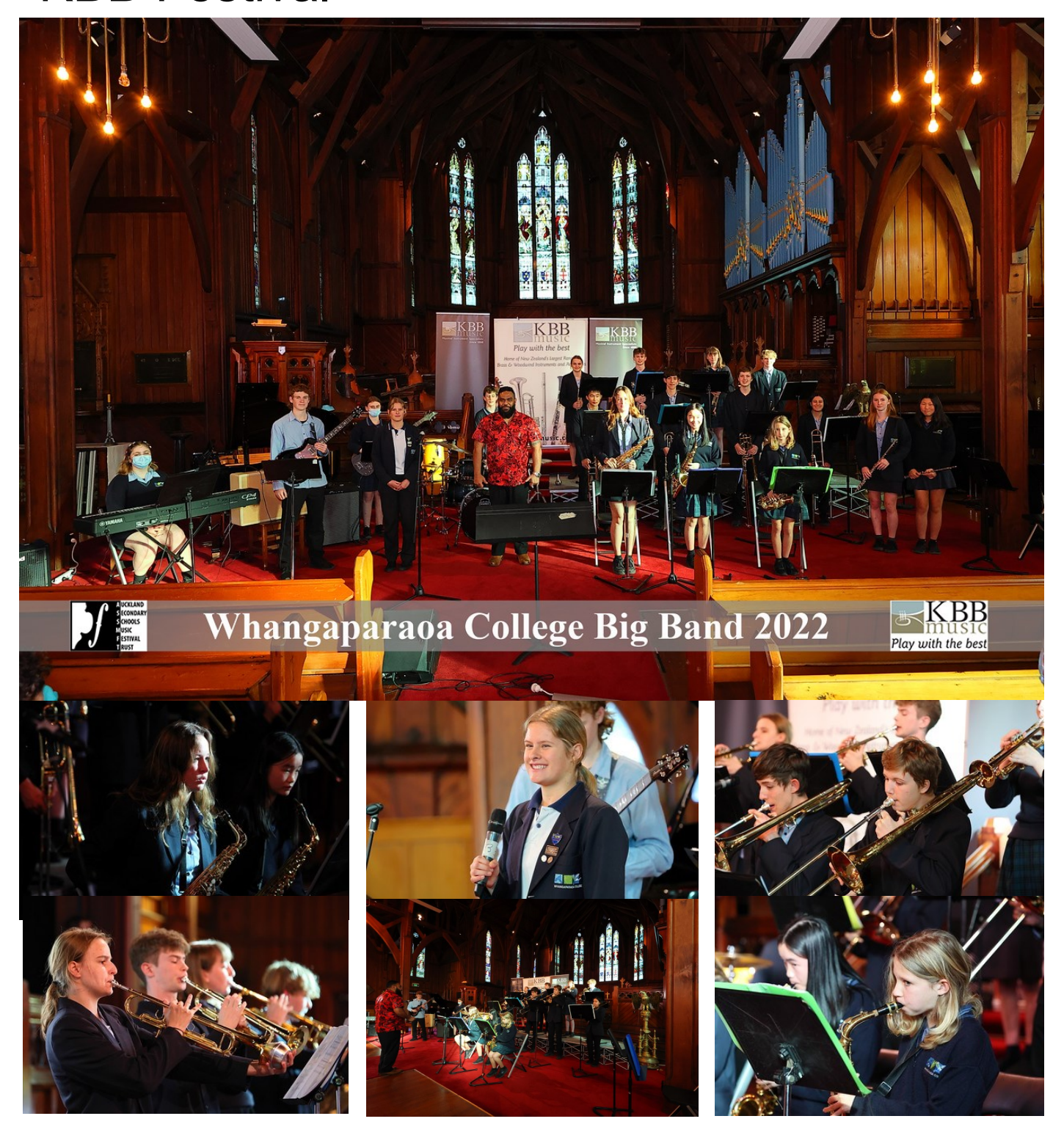
On Thursday 11 August, both of our school bands (Big Band & Concert Band) performed at the KBB Festival in Parnell, Auckland City.

The Concert Band performed in the Holy Trinity Church at 11 am followed by the Big Band at 4 pm in the Saint Mary's Cathedral. This is always an amazing festival to be part of and it was great to see and hear other Auckland school bands.