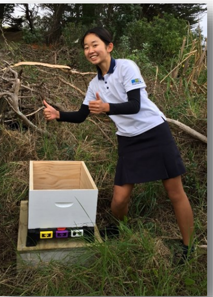
Kano setting up the beehive