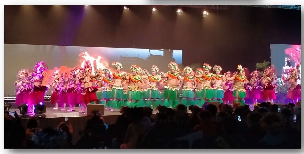
Taia Family Performance