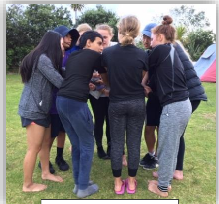
"The Human Knot"