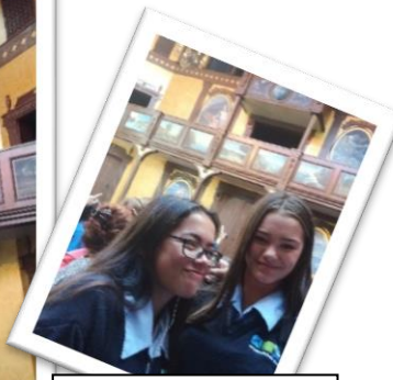
Pop Up Globe