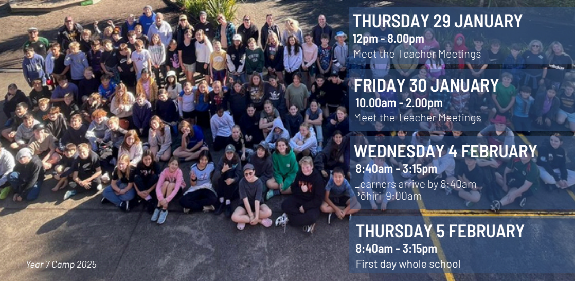
Year 7 Camp 2025